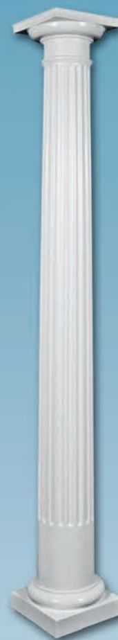
Fluted Round Tapered