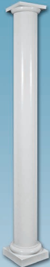
Plain Round Non-Tapered