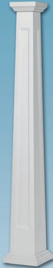
Recessed Square Tapered *Available in plain