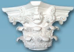
Roman Corinthian Capital