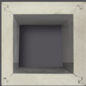
E-Z Joint Column Shaft Assembly

Installation Notes: Columns are manufactured from Premium Cellular PVC and are not primed or painted. Non-Tapered caps and bases are assembled around column shaft. Tapered caps and bases attached to ends of column shafts. Panel and Recess columns can be trimmed a maximum of 6" for most sizes. Custom sizing available. Columns are decorative and are not load bearing. Trim, drill and fasten with traditional carpentry tools. Prime and paint with Acrylic Exterior Latex paint. Ten (10) Year limited warranty if installed according to installation instructions. Dimensions subject to change without notice.