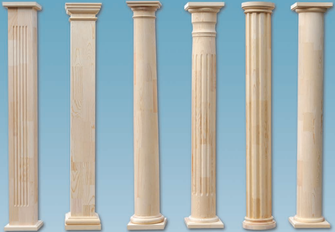
Fluted Square Regency