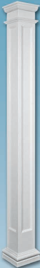
Recessed Square Non-Tapered