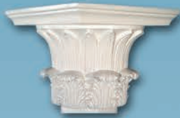
Temple of Winds Capital