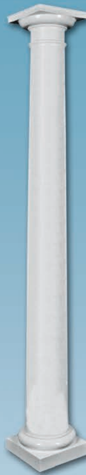
Plain Round Tapered